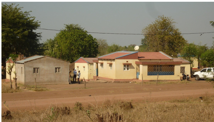
Concordia Lutheran Centre in Sena ,Mozambique